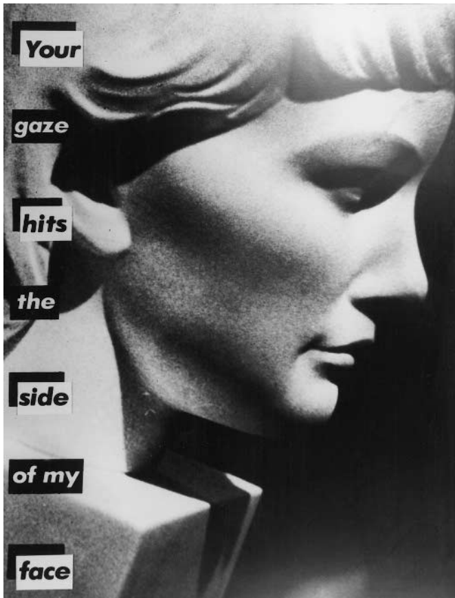
17. Untitled (Your gaze hits the side of my face) (1981) by Barbara Kruger. Art with a message: how violent is the male gaze?