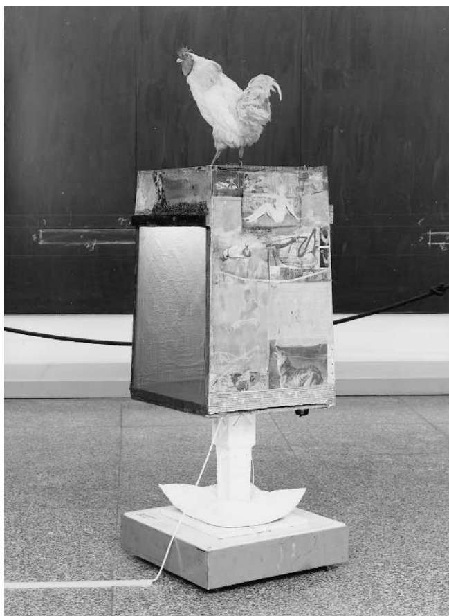
21. Odalisk (1955–8) by Robert Rauschenberg. 'Image leads to relativism leads to doubt.' Then what is the bird doing on top of it all?