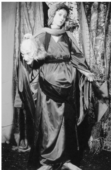
16. Untitled, #228 (1990) by Cindy Sherman. Acting out and the threat of castration: is Judith's story also Cindy Sherman's?