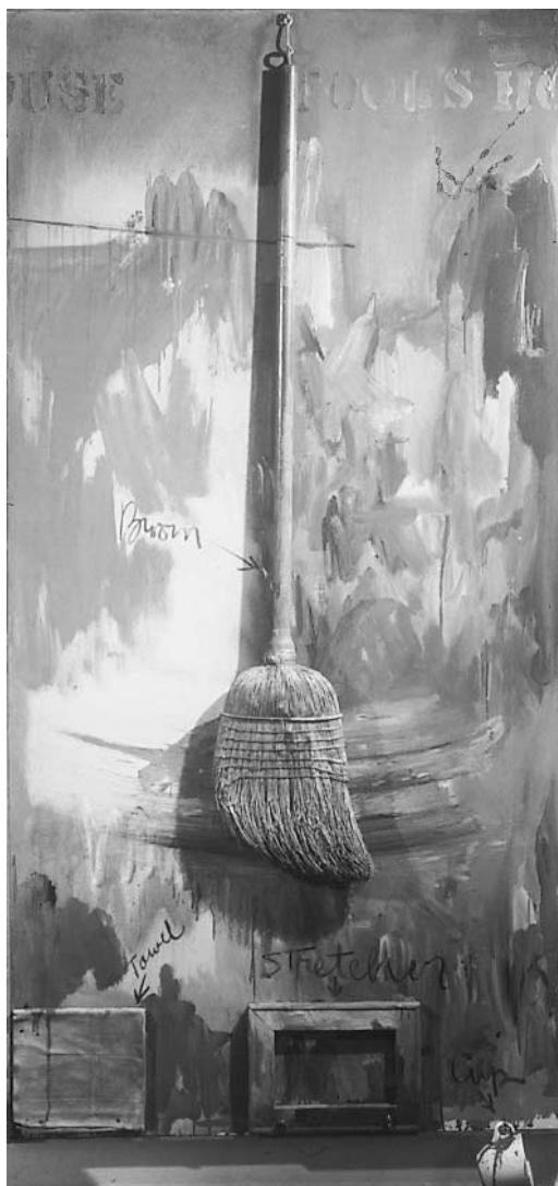
5. Fool's House (1962) by Jasper Johns. Language, theory, the object, and art. Is this a paint brush?