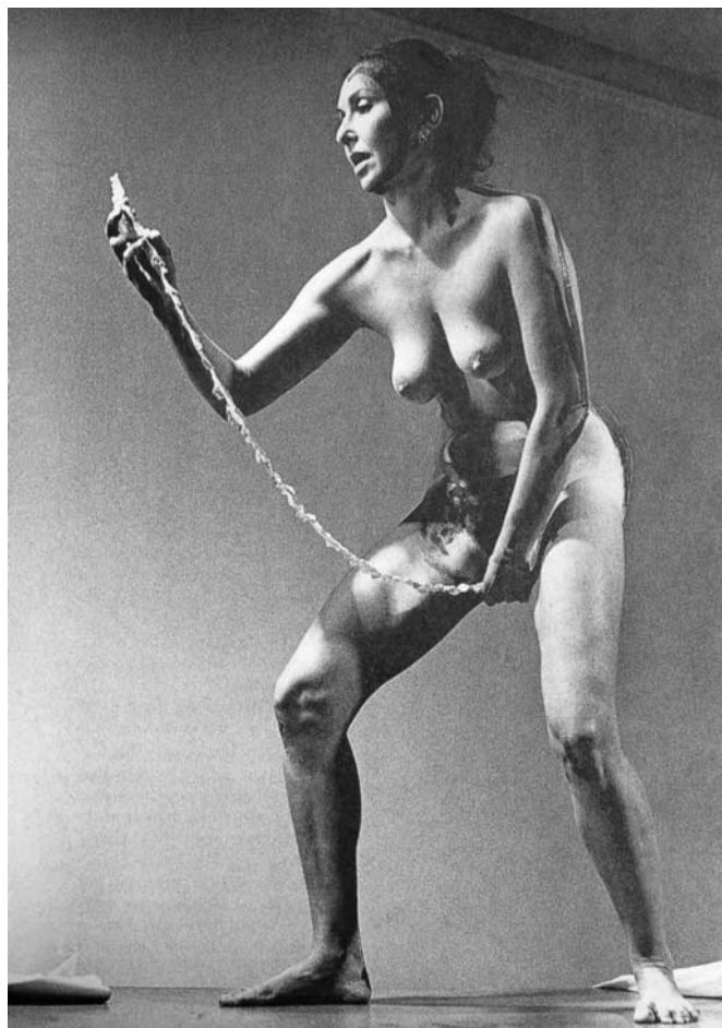
15. Interior Scroll (1975) by Carolee Schneeman. We write with the body, but with what sense can women's writing also come from the body?