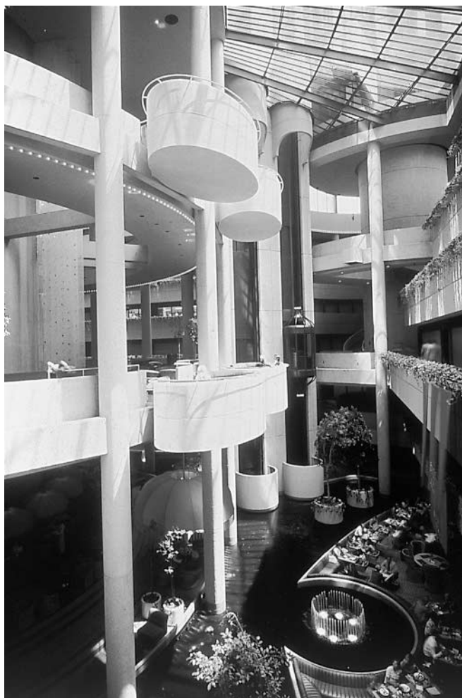
1. Interior of Westin Bonaventure Hotel by Portman. 'Postmodernist hyperspace'.